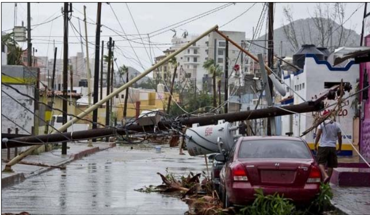
A BBC photo shows damage in Cabo San Lucas after the recent hurricane.