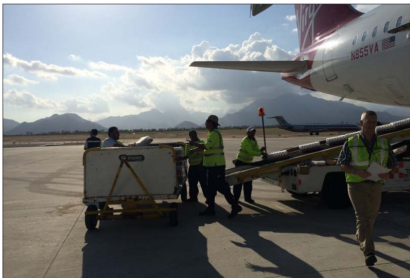
Rampers load fresh water onto the humanitarian flight from Cabo San Lucas.