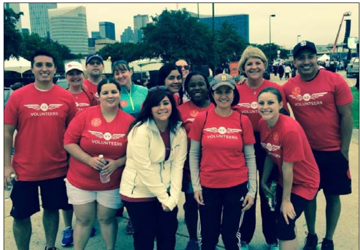
New SFO teammates, and some destined for other stations, participate in the Dallas Heart Walk last month.